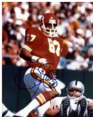
Art Still X-NFL PRO-BOWLER